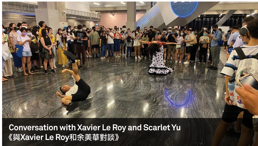
Conversation with Xavier Le Roy and Scarlet Yu 《與Xavier Le Roy和余美華對談》

22.02.2023 (WED) 6:30PM - 8:00PM Dance Studio 1 1號舞蹈室